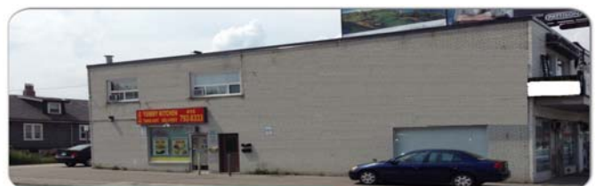
Pictures of new Mosque Location